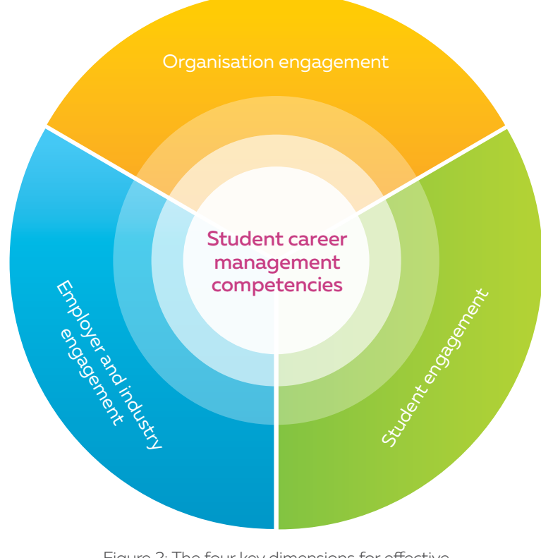
Figure 2: The four key dimensions for effective tertiary career development