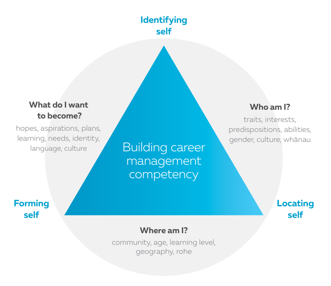
Figure 1: A competency approach to career development